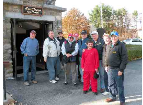
A motley crew!