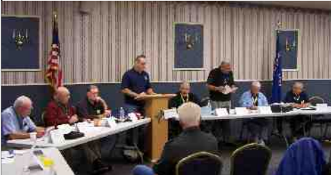
(October meeting photo)

Do you know what “consubstantial” means?