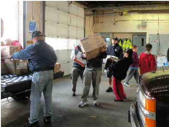
Loading the trucks at the fire station.