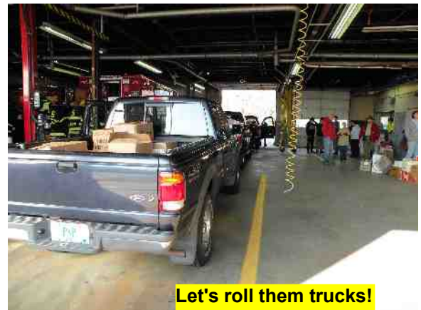
Let's roll them trucks!