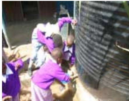
Children drinking well water.