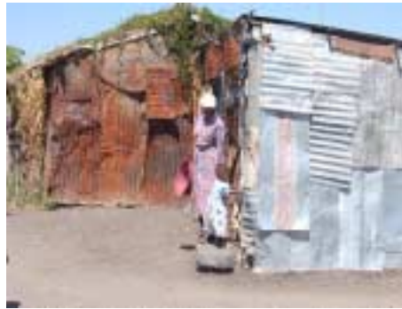
Homes in Fanaka II village