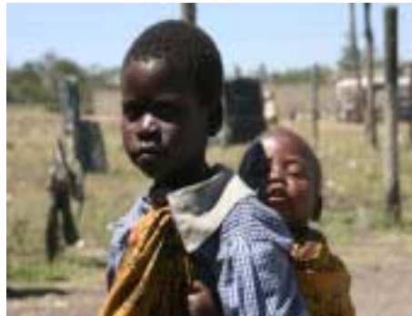
Young girl carrying her brother.