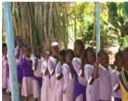
Children praying before their meal.