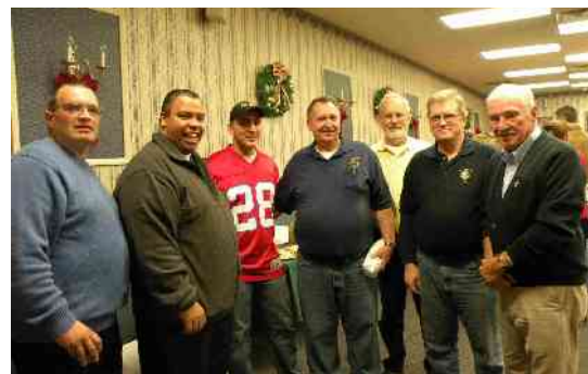
Santa's Elves make the party happen!