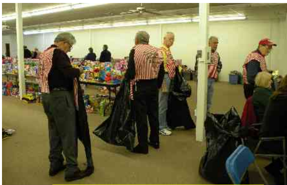
Lining up to help the shoppers