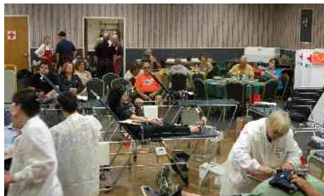
At the Blood Drive "Just a little pinch."

Soldier Aid Report Total for 2011: 31 boxes; 488 lbs. Grand Total: 329 boxes; 4,671 lbs.