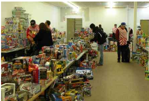
Helping the first shoppers