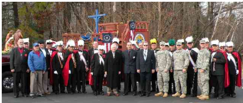
Is everyone ready?