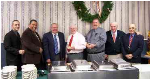
Christmas Party Workers