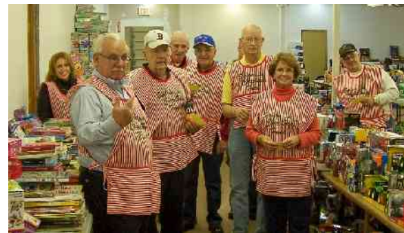
“Hey, you guys, over here!”