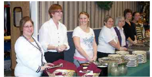
“Our Mission is to Serve!”