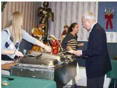
Only person to go for 2nds!