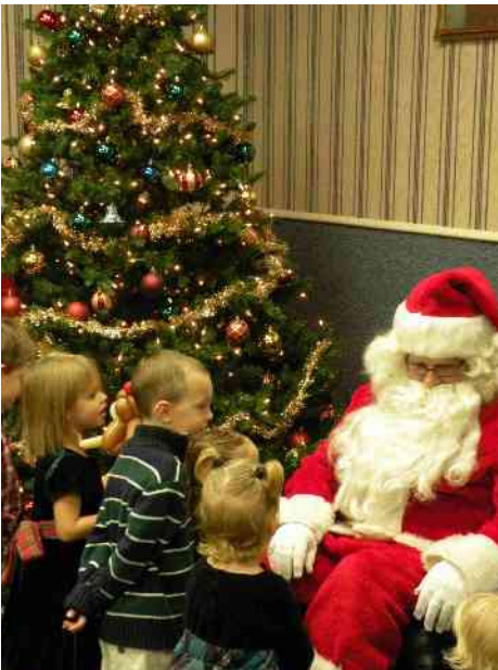
Santa Giving the Presents