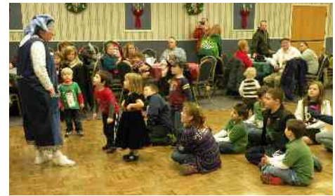
The Clown and her Court!