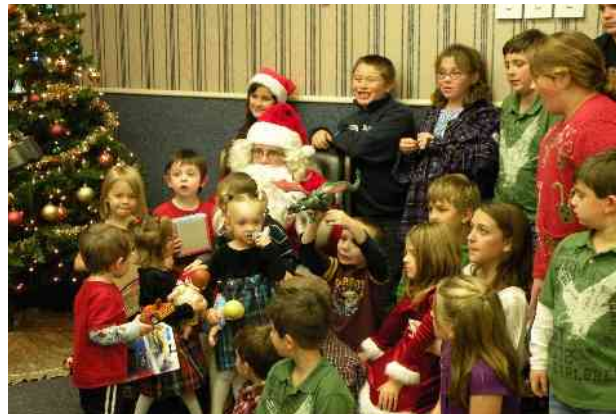
"Thank you, Santa!"