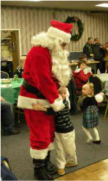
Santa gets a welcome hug.